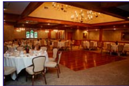
Puritan Backroom Conference Room

Nominees may include teachers, teams, paraprofessionals, bus drivers, guest teachers or any one else whose work supports staff members for their work in reinforcing best middle level practices or community members for exhibiting commitment to and support for middle level education in their local school.